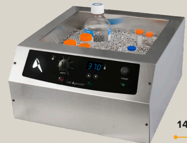
14L Bead Bath