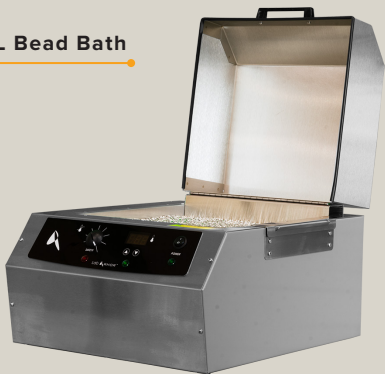
7L Bead Bath